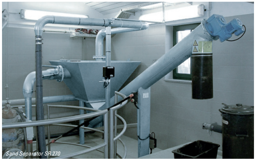
Sand Separator SR 270